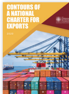
PBC's Contours of a National Charter for Exports