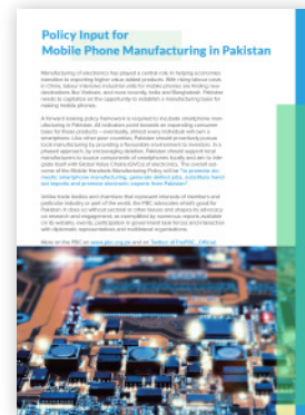
PBC Policy Brief on Mobile Phone Manufacturing in Pakistan