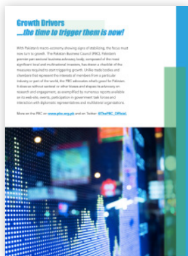
Growth Drivers ... the time to trigger them is now!

A total of '5' publications were released during the Quarter; this brings the total number of publications in the current year to '10'. The five publications released in the Third Quarter were: