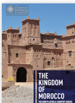
The Kingdom of Morocco – North Africa Country Series