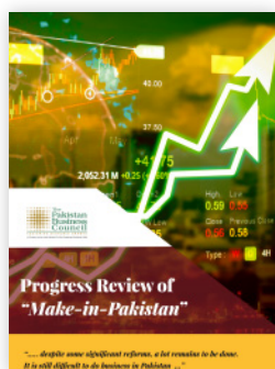
Progress Review of "Make-in-Pakistan"

A total of '3' publications were released during the Quarter, these were: